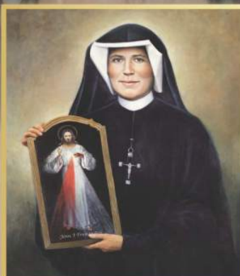
St. Maria Faustina Kowalska, OLM