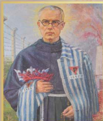
St. Maximilian Mary Kolbe, OFM Conv.