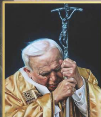
Pope St. John Paul II