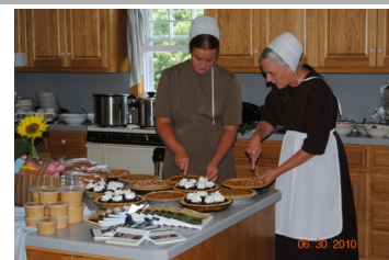
Dinner in a Amish Home