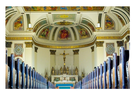
St Casimir's, Baltimore

6:30 a.m. Departs St Stanislaus Church Chicopee, MA