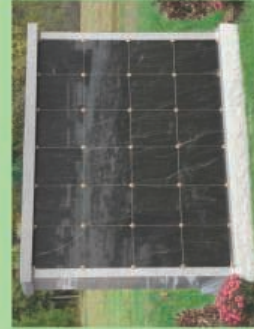
POLISHED GRANITE INTERIOR NICHE